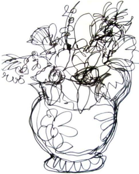
Continuous Line Drawing

Website: www.thedraftedline.com/teaching