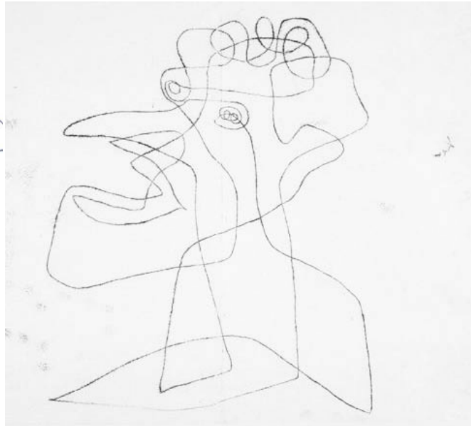
Der Man mit dem Mundwerk, drawing by Paul Klee, 1930

"A line is a dot that goes for a walk" – Paul Klee